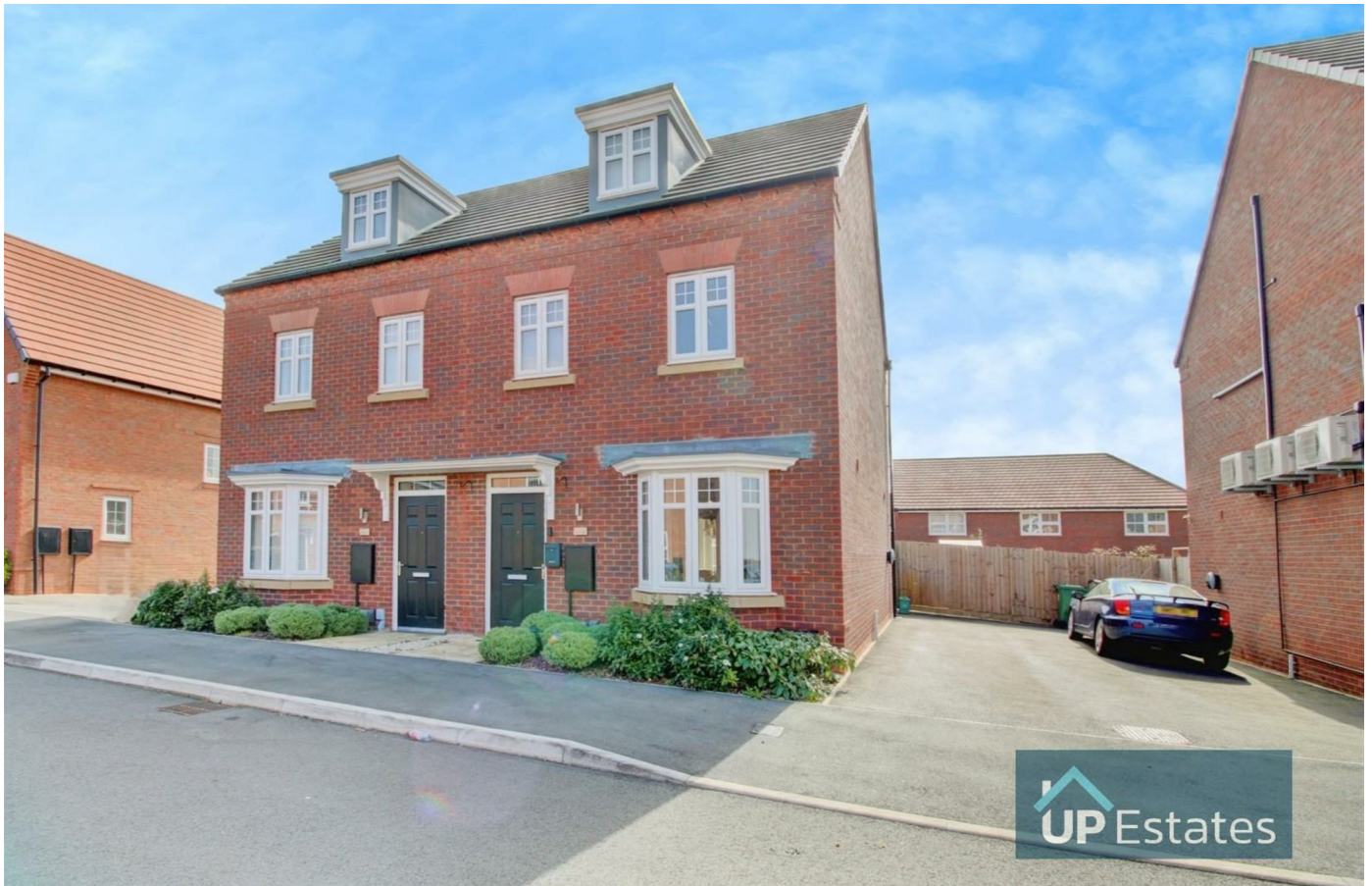
Talbot Drive, Warwick